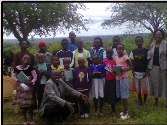
GVCN GLOBAL CARE, DISTRIBUTING SCHOOL SUPPLIES TO ORPHANS IN KITUMBI VILLAGE, MWINGI, KENYA